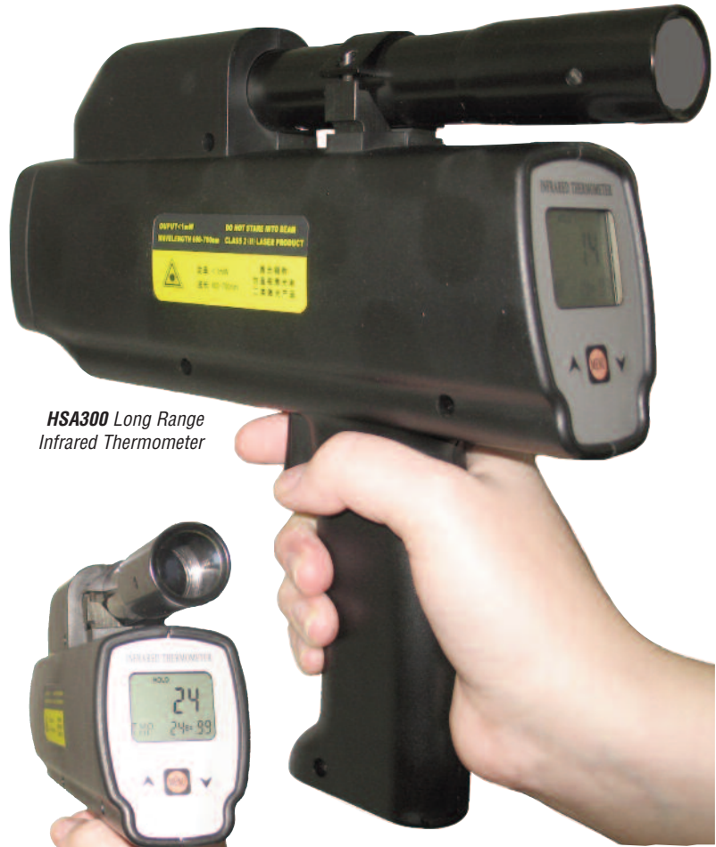
HSA300 Long Range Infrared Thermometer

Peak temperature is displayed on the large main display easing the ability to capture the hot spot. The current temperature is displayed on the smaller secondary display.