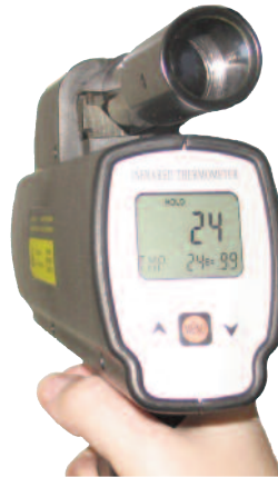
The HSA300 offers a large, easy to read digital display.